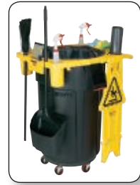
Roomy pockets hold cleaning supplies (not incl.).