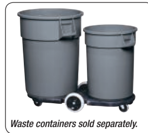
Waste containers sold separately.