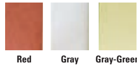
Red Gray Gray-Green

* Contains 30% post-consumer recycled content, 100% total recycled content.