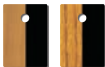
Cherry/Black (CY) Oak/Black (MO)