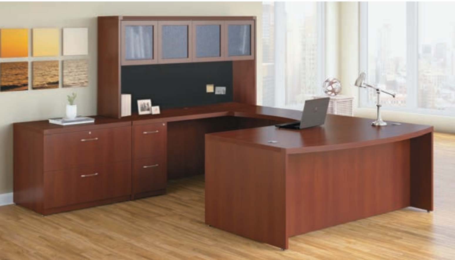
U-WORKSTATION WITH STACK-ON STORAGE