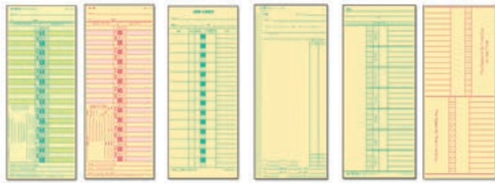
A Biweekly B Job Card C Weekly D Weekly