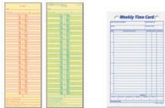
L Semimonthly M Weekly