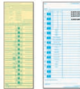
J Weekly K Weekly

M Weekly Employee Time Card For manual time records. Columns for day, job description, hours, rate, amount, payroll deductions and earnings. Days of week not printed. Space for deductions: FICA, federal and state withholding, union, other and total. 143 lb. manila stock. 100 cards per pack.