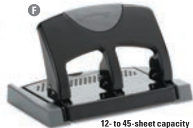
12- to 45-sheet capacity