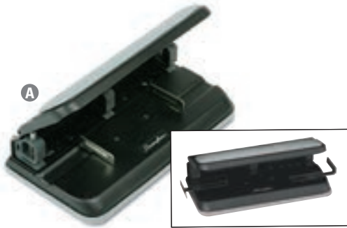
32-sheet capacity; Centimatic® feature for accurate centering