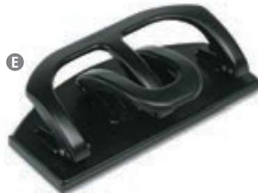
20-sheet capacity; One side punches three holes