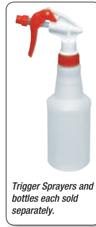
Trigger Sprayers and bottles each sold separately.