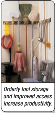
Orderly tool storage and improved access increase productivity.